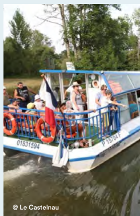
@ Le Castelnau

Rue de Dunkerque - Gravelines +33 (0)3 28 65 33 77